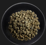
MANDAILING NORTH SUMATERA