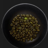
PAGAR ALAM SOUTH SUMATERA